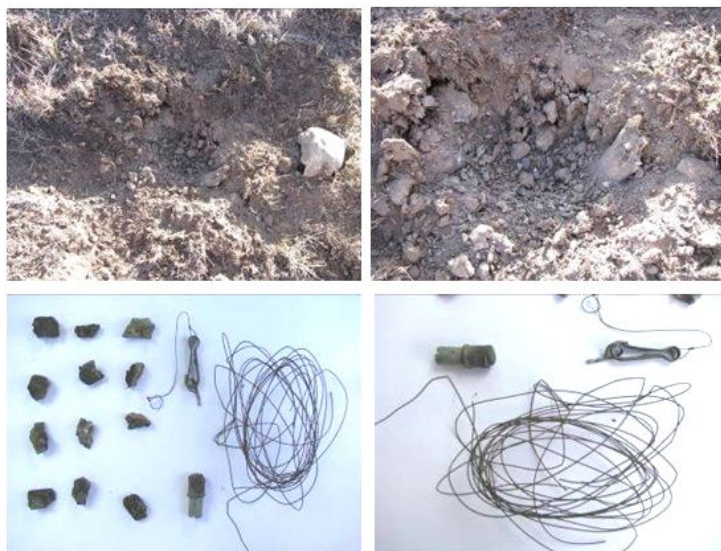
[The crater and removed fragments are shown above.]

During the analysis of the place of the explosion, the remaining mine stick and excessive fragmentation found in the area provided evidence that the POMZ-2M was lying on its side. The mine was on the top of the earth. The below shows the depth of the crater.