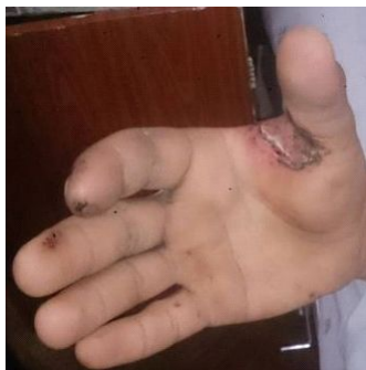
Casualty's right hand.