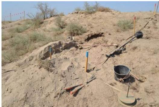
Place of accident

Pictures of all evidence were taken and attached to report.