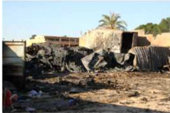
K73 03/03/12 - 09:22 View through the hole in the wall towards the destroyed container area. This is the final picture found on the SD Card.

Type 84 mine in unknown, but possibly armed,