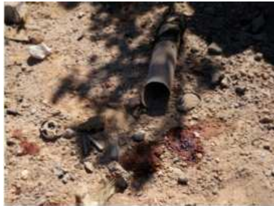
S10 03/03/12 Site of the accident with Leatherman tool and remains of detonated Type 84 mines.

[The investigators noted that the Leatherman was with the bloodstained remains of the detonated mines but did not mention it again.]