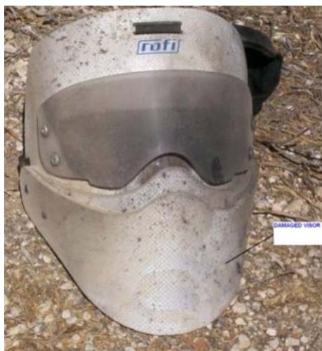
[The mask-visor after the accident.]

Mask Visor, Damaged (Reusable need Maintenance).