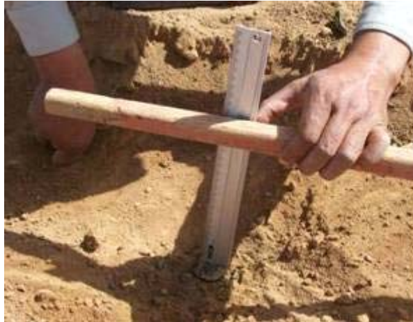
[Measuring crater depth]