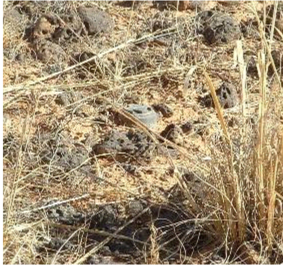
[Many mines are visible in the minefield.]

a) Did the incident occur in a cleared, safe or contaminated area? Accident occurred in the cleared area